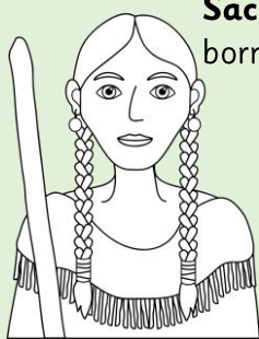
Sacagawea was born in 1788.